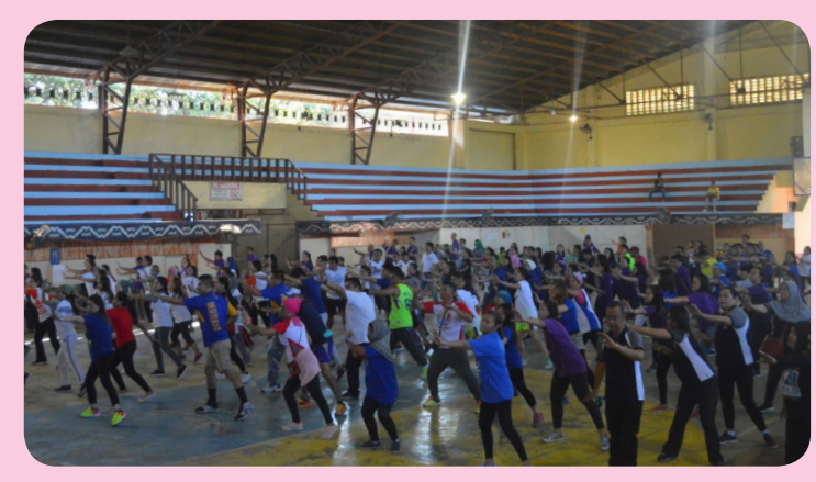
A total of 263 government workers in Region XII loosen up in the "Zumba for A Cause" spearheaded by CSC RO XII on 7 September at the Cotabato City State Polytechnic College, Cotabato City.