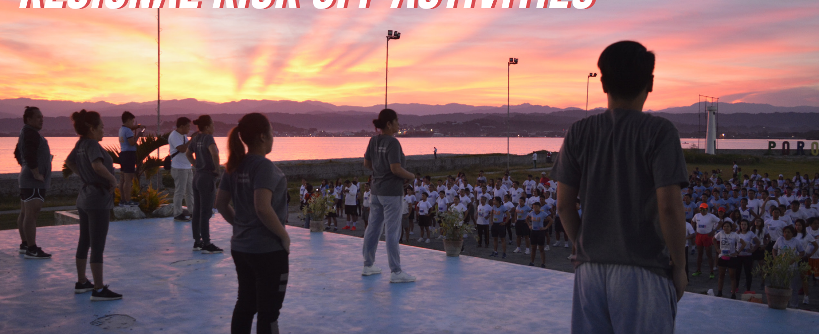
A beautiful sunrise at the bay served as the backdrop for the calisthenics and stretching exercises before the start of the "Fun Run and Zumba 2018" held 6 September at Poro Point Freeport Zone and Baywalk, San Fernando City, La Union. More than 1,500 government officials and employees participated in the event spearheaded by CSC RO I and CSC Field Office-La Union, in cooperation with the Association of Regional Executives in Region 1.