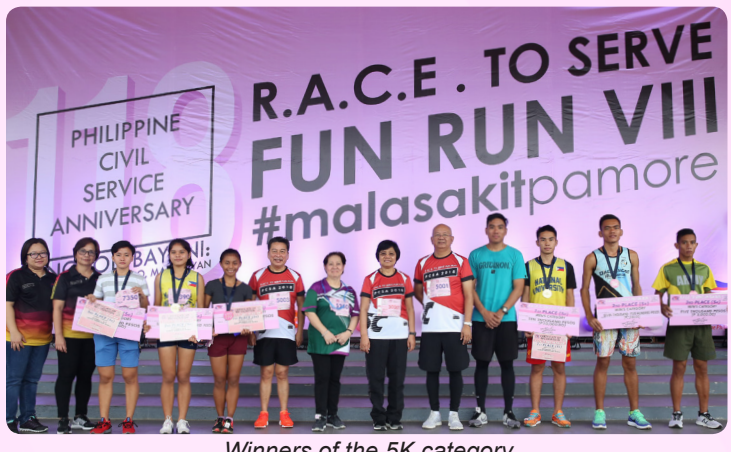
Winners of the 5K category