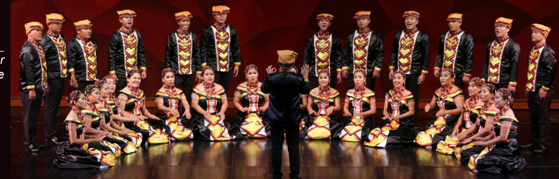
The DepEd Division of Agusan del Sur Teachers' Chorale