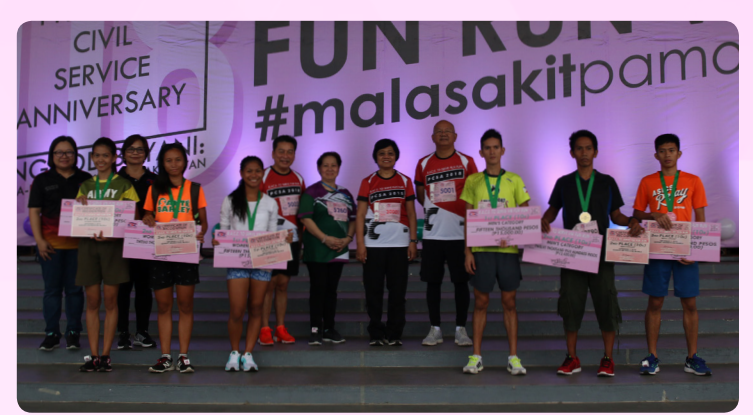
Winners of the 10K category