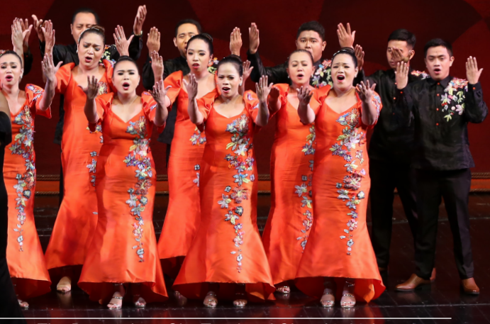
The Dasmarinas City Teachers' Chorale, 2nd runner up

The DepEd Catanduanes Division Choral, 3rd runner up